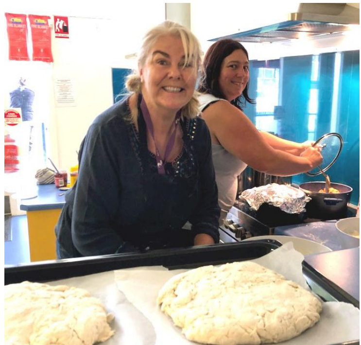
CRAFTING THE DELICIOUS DAMPER

RESPECT RESPONSIBILITY RELATIONSHIPS RESILIENCE