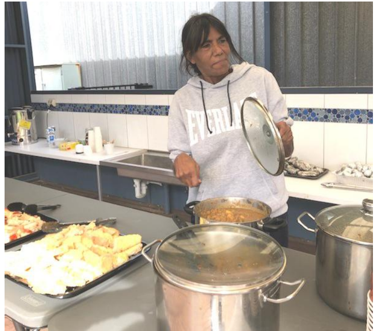
GIRLIE CHECKING THE KANGAROO STEW AT COOK OUT