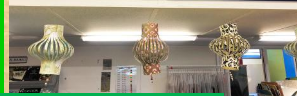
Vietnamese Hats & Lanterns made by students