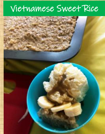
Vietnamese Sweet Rice