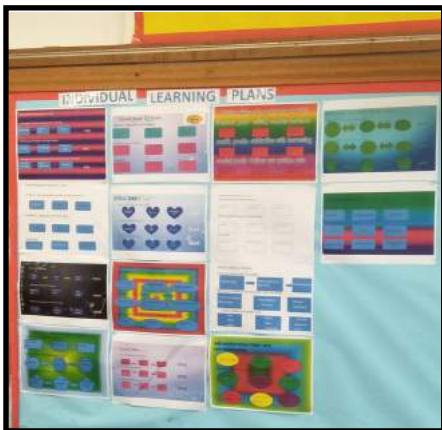
B2R1 Learning Goals and steps to success.

Aboriginal Education Leader, Lincoln Gardens Primary School.