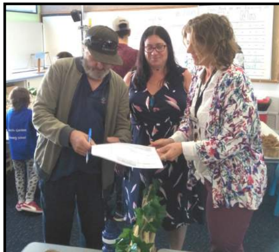
B2R7 staff and parents working together to educate our students.